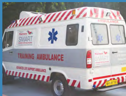
ADVANCE LIFE SUPPORT AMBULANCE