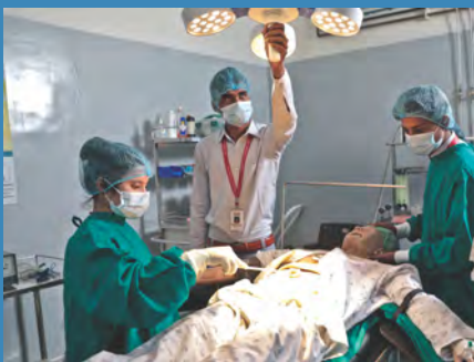
OPERATION THEATRE LAB