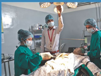
OPERATION THEATRE LAB