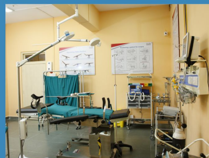
BASIC SKILLS LAB