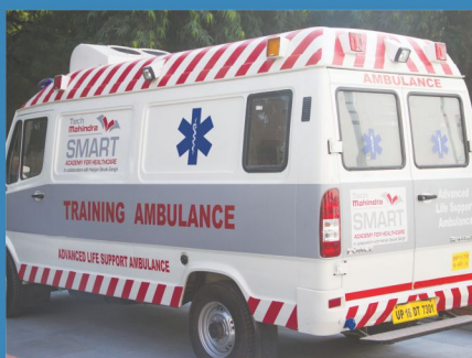
ADVANCE LIFE SUPPORT AMBULANCE