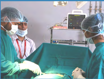
OPERATION THEATRE LAB