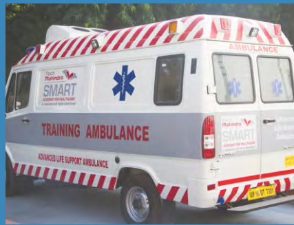
ADVANCE LIFE SUPPORT AMBULANCE