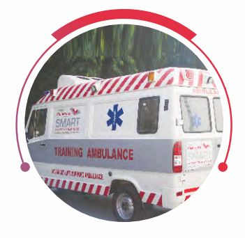
ADVANCED LIFE SUPPORT AMBULANCE