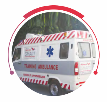
ADVANCED LIFE SUPPORT AMBULANCE