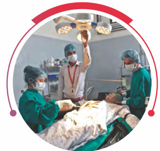
OPERATION THEATRE LAB