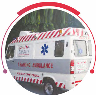
ADVANCED LIFE SUPPORT AMBULANCE