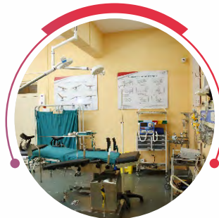
BASIC SKILLS LAB