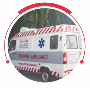
ADVANCED LIFE SUPPORT AMBULANCE